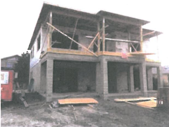
FRONT VIEW 02/12/16