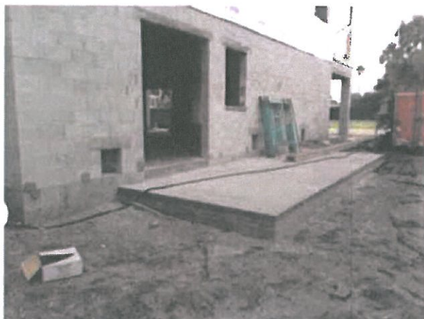
LEFT VIEW 02/12/16