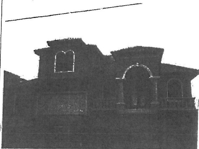
LOT 62, FRONT