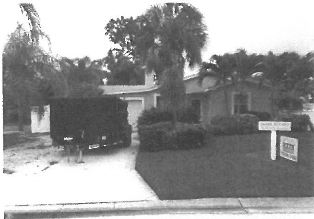
FRONT VIEW 07/27/15