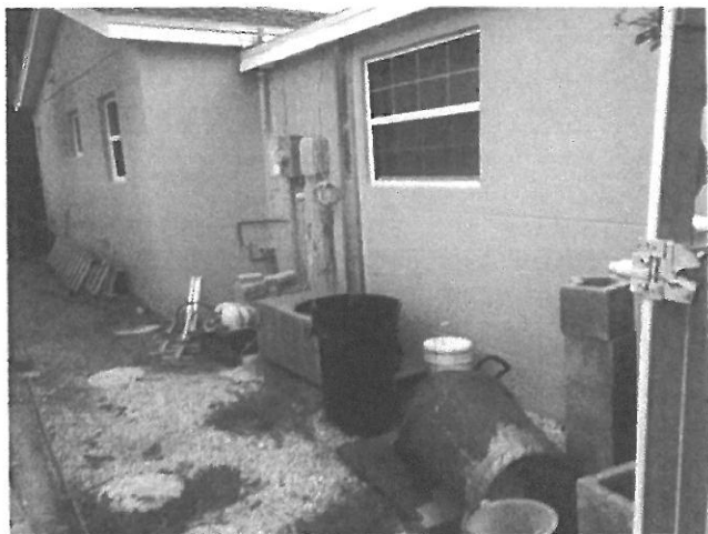
LEFT VIEW 07/27/15