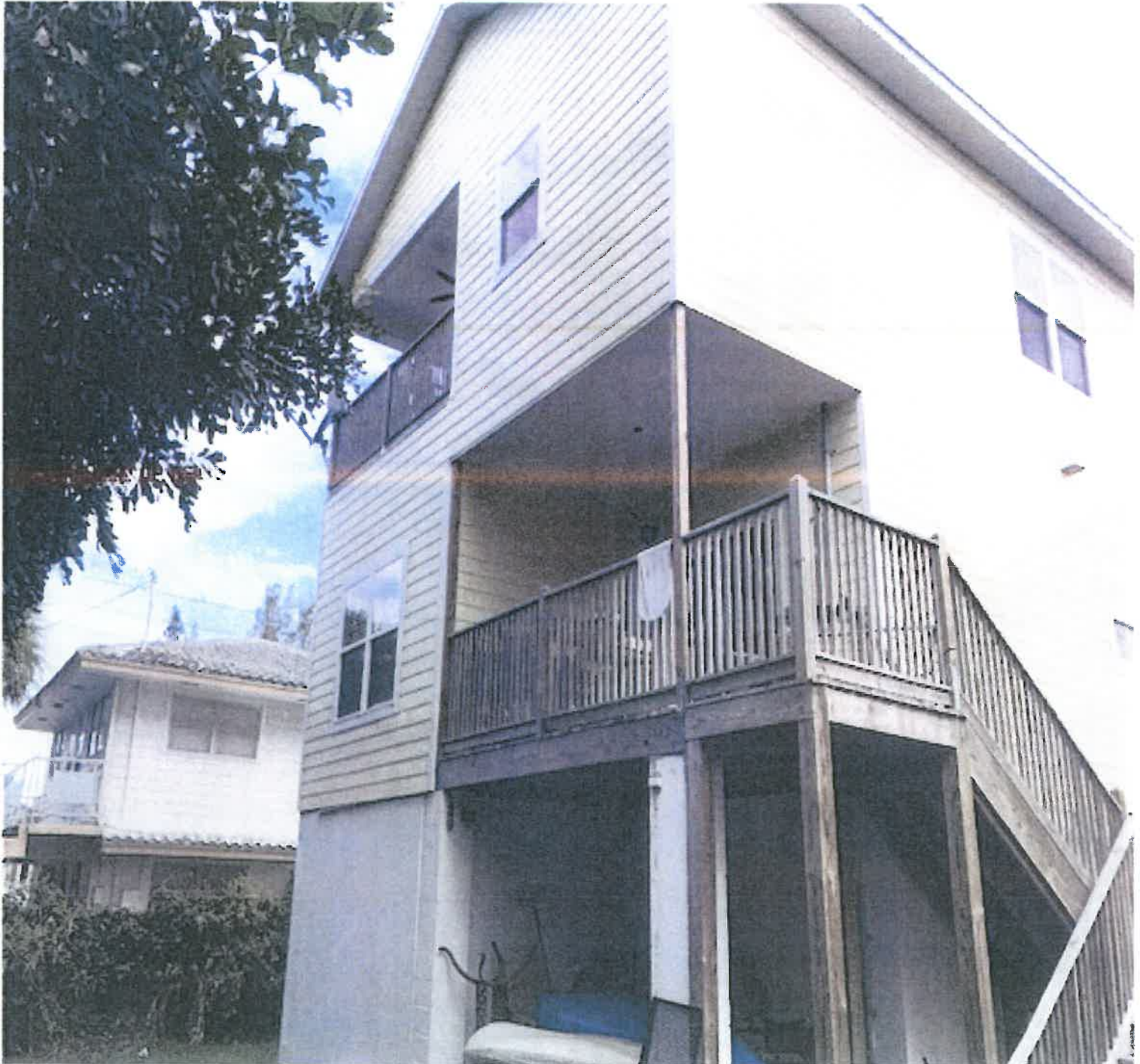
JOB NO 1408-001